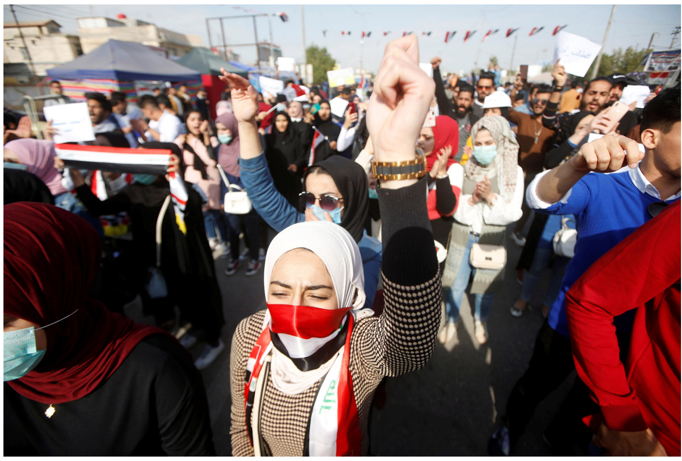
University students protesting American and Iranian intervention in Iraq, Basra, January 8, 2020

The Biden administration will not have a lot of time for the Middle East. Its foreign policy agenda will more likely be shaped by the looming question of how to come to grips with Xi Jinping's China. The Middle East, with the significant exception of Iran, poses no plausible serious challenge to US interests. There is also a lack of resources and opportunities to advance them. This is in part a legacy of the decadeslong war in Iraq, which cost trillions of dollars and exhausted US ground forces, while compromising America's international reputation; regime change in Libya, which prompted the return of thousands of jihadists and a civil war that immiserated the country; and the Syrian civil war, which Washington prolonged and intensified by inadvertently supplying jihadists with potent weaponry. And in part this turning away from the Middle East reflects changes in the oil market: the US is the world's largest producer of fossil fuels, the cost of renewable energy is dropping sharply, electric vehicles dominate new production in the automotive sector, and the effects of global warming are lending urgency to a shift away from oil.